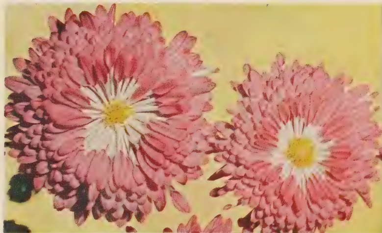
MAGENTA SPOON. 60c each; 3 for $1.50